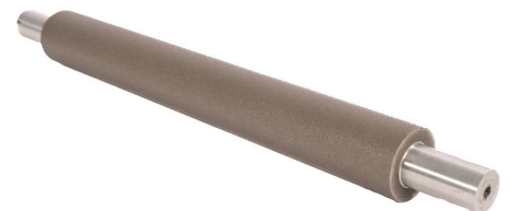
Specialty Coated Rollers

Finzer Roller – Precision. Performance. Partnership.